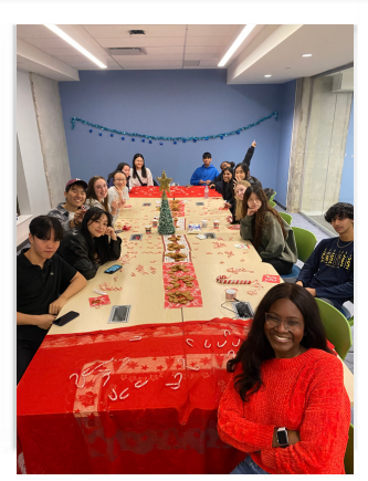
Novermber 2022 - Albert St. Holidy Treat