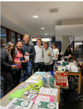
October 2022 - Leggett NIY Midterm Care Event