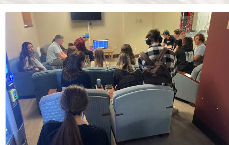
October 2022 - IMcNeill Jeopard Night