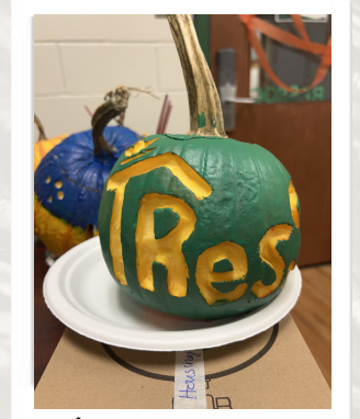
October 2022 - ResSoc Pumpkin