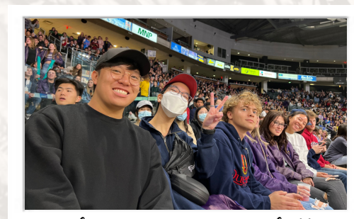
September 2022 - JCC Basketball game